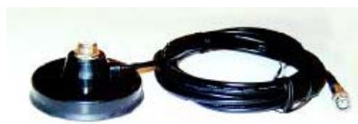
MM-90 Magnetic Mount for 7dB 2.4GHz Antenna