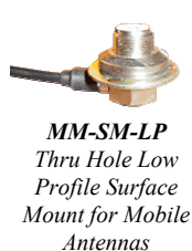
MM-SM-LP Thru Hole Low Profile Surface Mount for Mobile Antennas