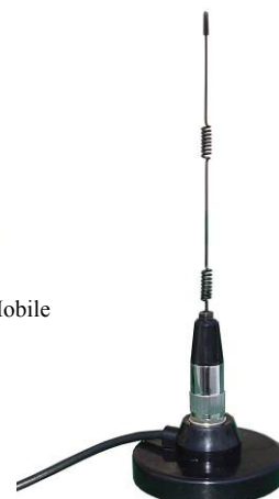
7dBi Mobile with Magnetic Mount (sold separately)