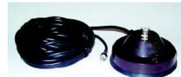
MM-110 Large Magnetic Mount