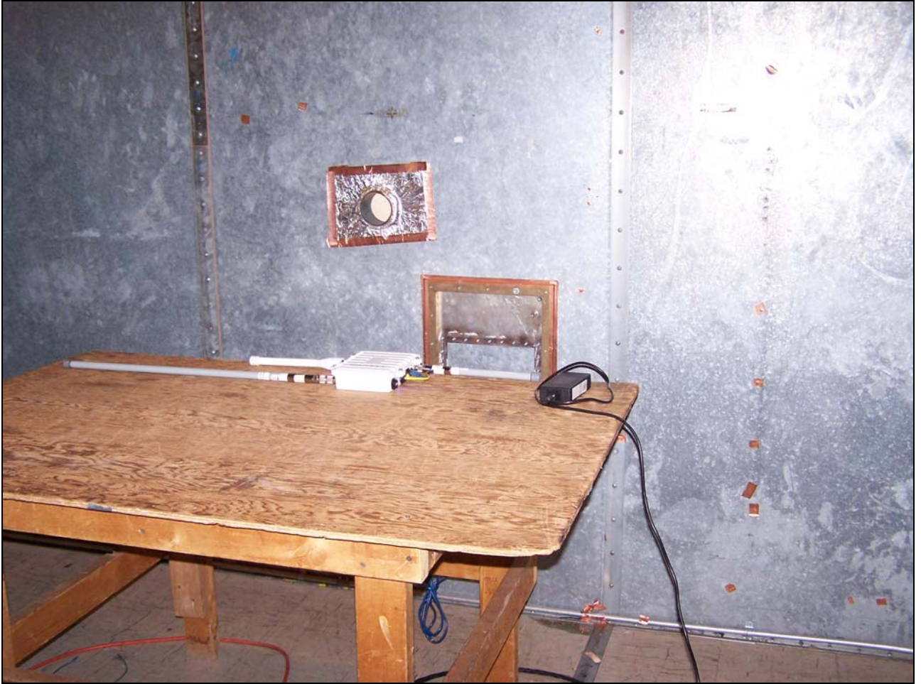
Photograph 3. Conducted Emissions, Test Setup