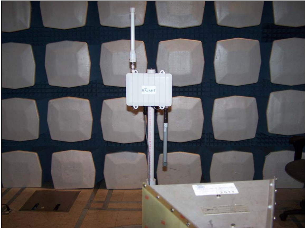
Photograph 3. Band Edge Setup