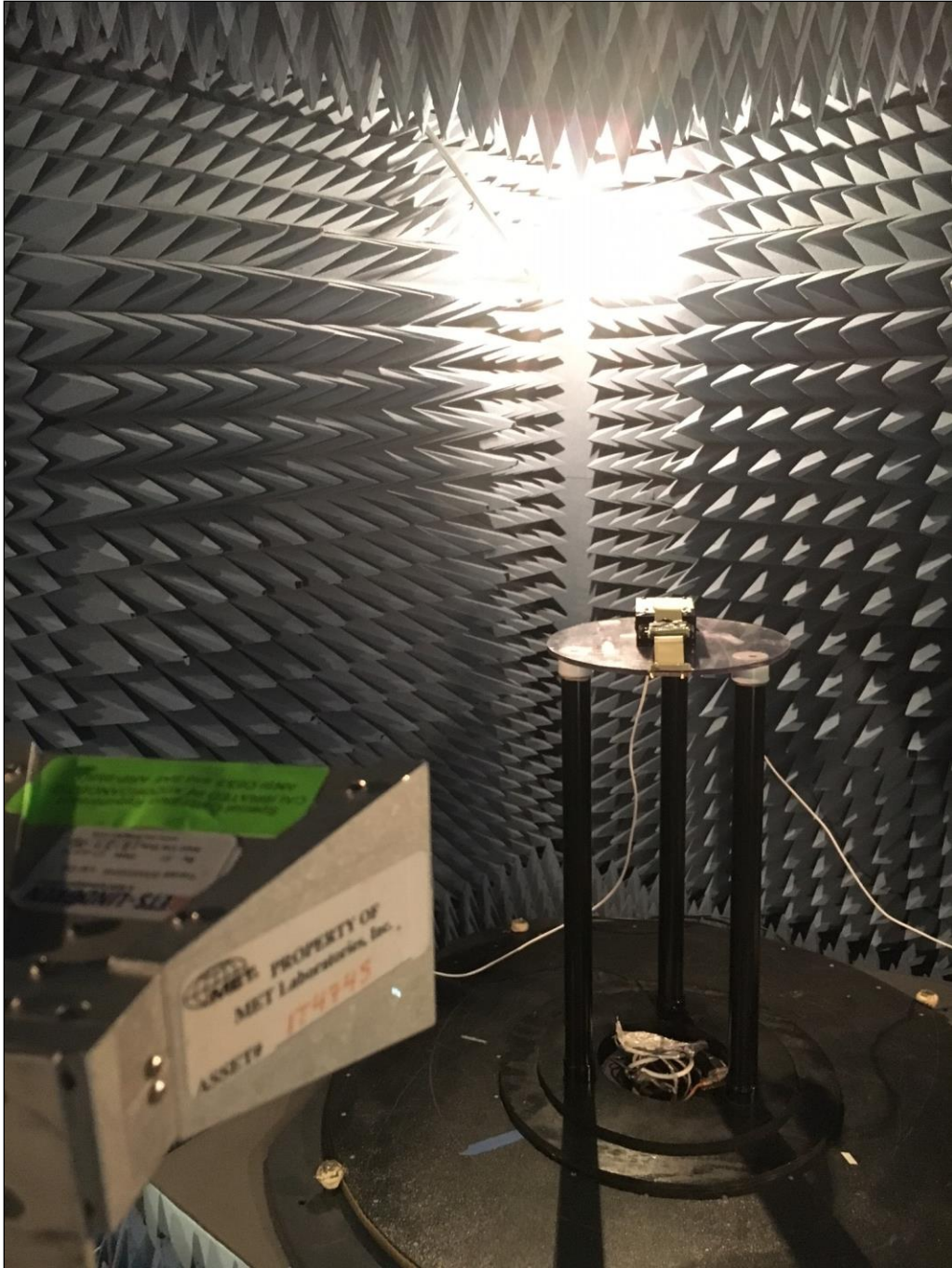
Photograph 3. Radiated Emission Spurious Test Setup, 18 GHz – 40 GHz