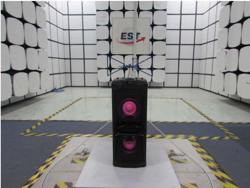
Radiated Test (1000-25000 MHz)