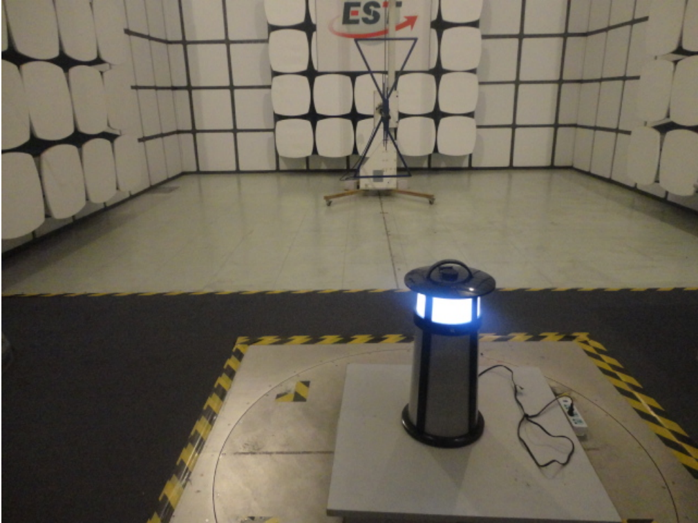
Radiated Test (1000-25000 MHz)