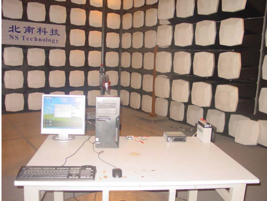
Figure 4 Test photo of Transmitter Spurious Emission (Normal operation 30-1000MHz)