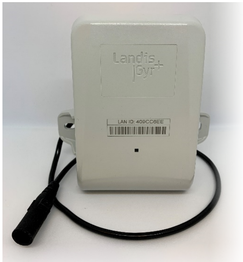
Figure 1. M511 Wall Mount Water Module

The M511 Wall Mount Water Module is a battery-operated radio module designed for automated water meter reading. The M511 is capable of reading water consumption data from residential and commercial water meters equipped with an Encoded or Solid-State Register. It has a two-way radio that is compatible with electric meters, routers, and mesh extenders for relaying water consumption data to the utility. It also has a low power mode for short distance communications to the Tech Studio field tools.