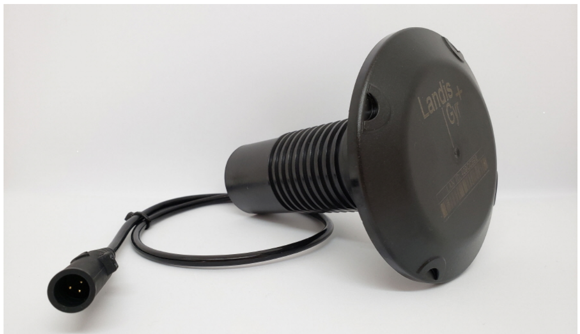
Figure 1. Series 5 Water M510 Pit Wall Mount

The M510 Pit Mount Water Module is a battery-operated radio module designed for automated water meter reading. The M510 is capable of reading water consumption data from residential and commercial water meters equipped with an Encoded or Solid State Register. It has a 2-way radio that is compatible with electric meters, routers, and mesh extenders for relaying water consumption data to the utility. It also has a low power mode for short distance communications to the Tech Studio field tools.