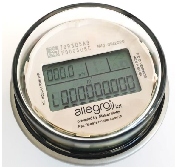
Figure 1 – Allegro IOT - Interpreter LR9

It has a 2-way radio that is compatible with Allegro IOT modules family, GW's for relaying water consumption data to the utility. It also has a single channel mode for short distance communication to the VTR tech tool in field.