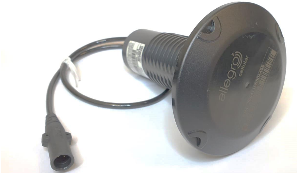
Figure 1 – Allegro Cellular PIT Module

The Allegro cellular PIT Module is a battery-operated radio module designed for automated water meter reading. The Allegro cellular is capable of reading water consumption data from residential and commercial water meters equipped with an Encoder or Solid-State Register. It uses CAT-M cellular radio for relaying water consumption data to the utility.