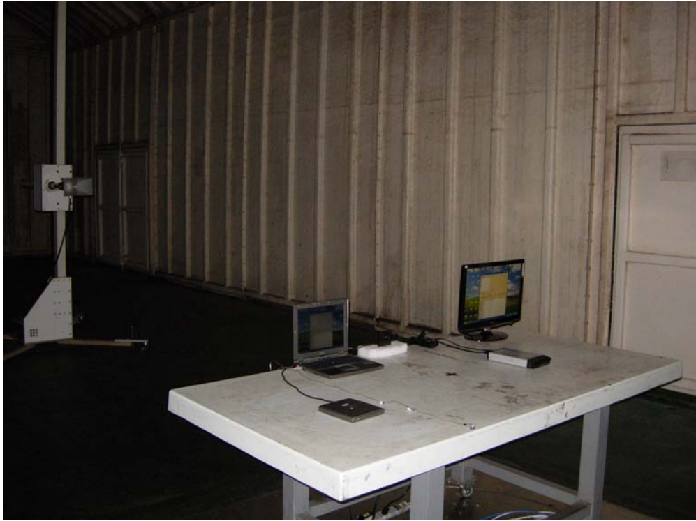
Back View of Radiated Test (TX) (Horn)