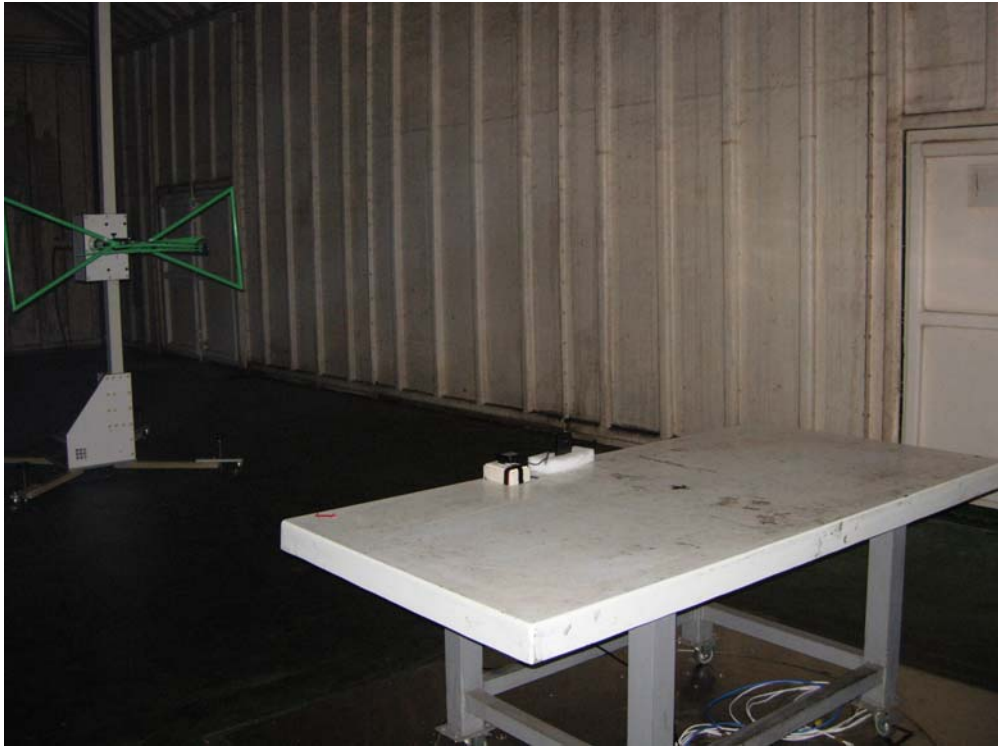
Back View of Radiated Test ( AC Charger)