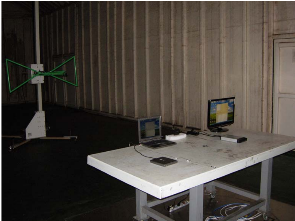
Back View of Radiated Test (TX)