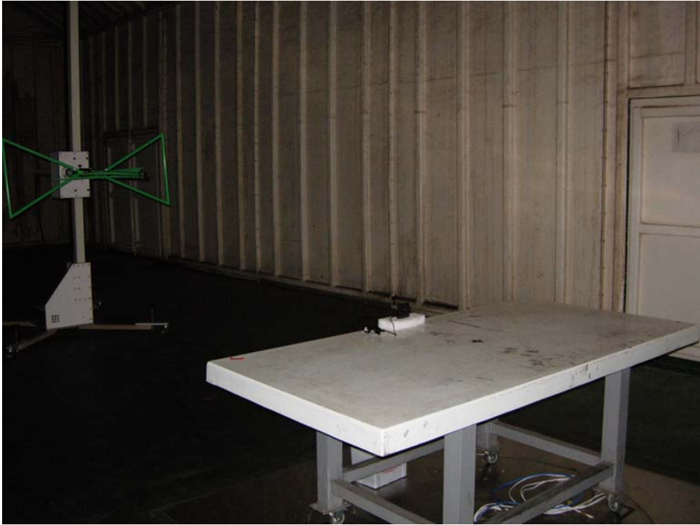
Back View of Radiated Test (DC Charger)