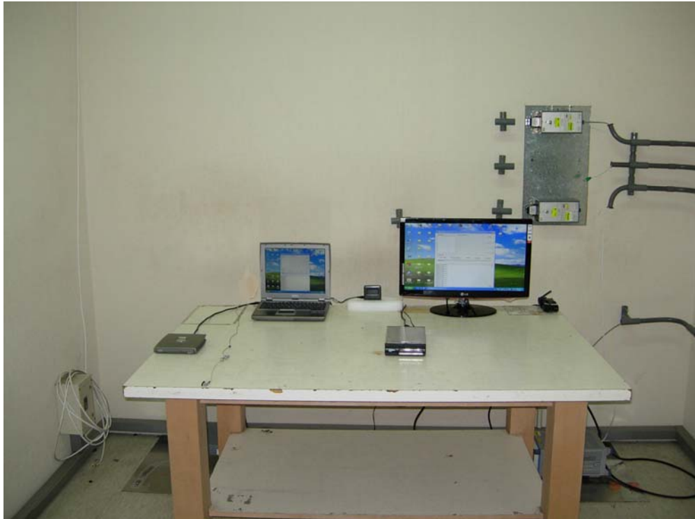
Back View of Conducted Test ( TX)