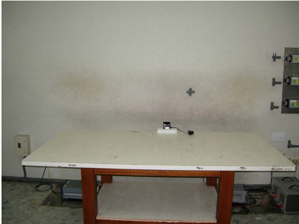
Back View of Conducted Test (DC Charger)