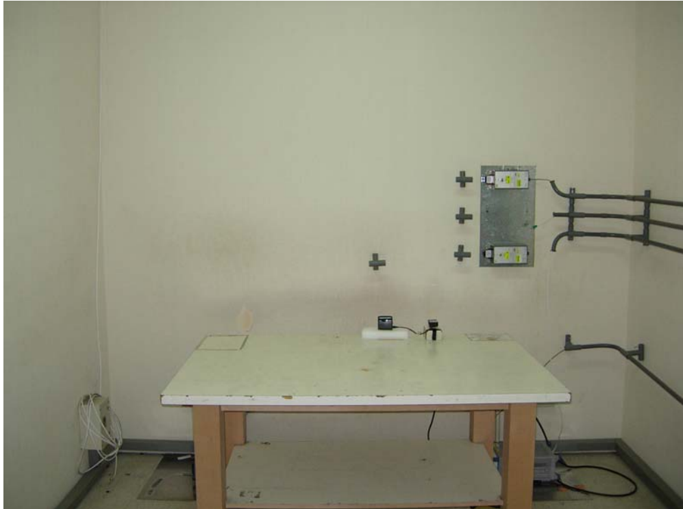
Back View of Conducted Test ( AC Charger)