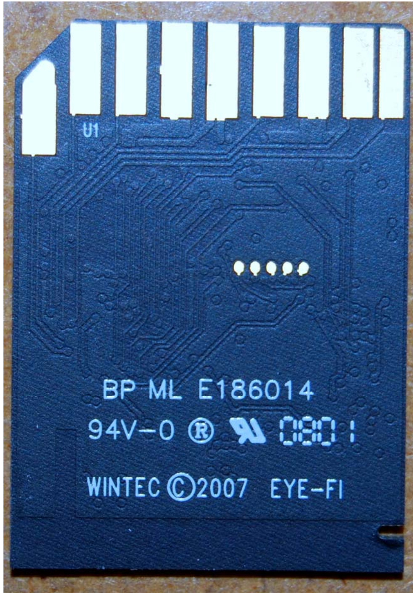
Figure 2: Eye-Fi Card internal Photo (back)