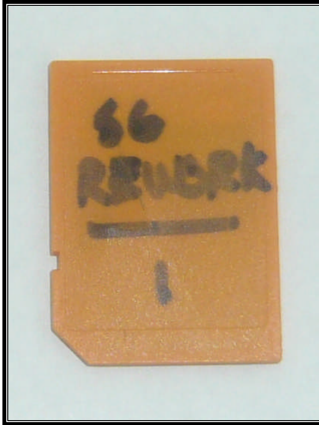
Figure 1: EUT Front View