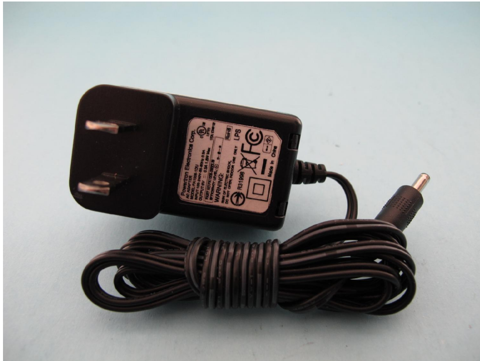
Ancillary - AC/DC adaptor

Test report no.: 60.870.11.001.01F Model no.: DS0820US (Transmitter)