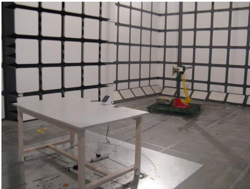
Radiated Emission - Rear View (Above 1 GHz)