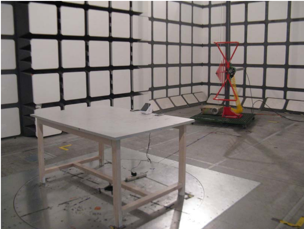
Radiated Emission - Rear View (30 -1000 MHz)