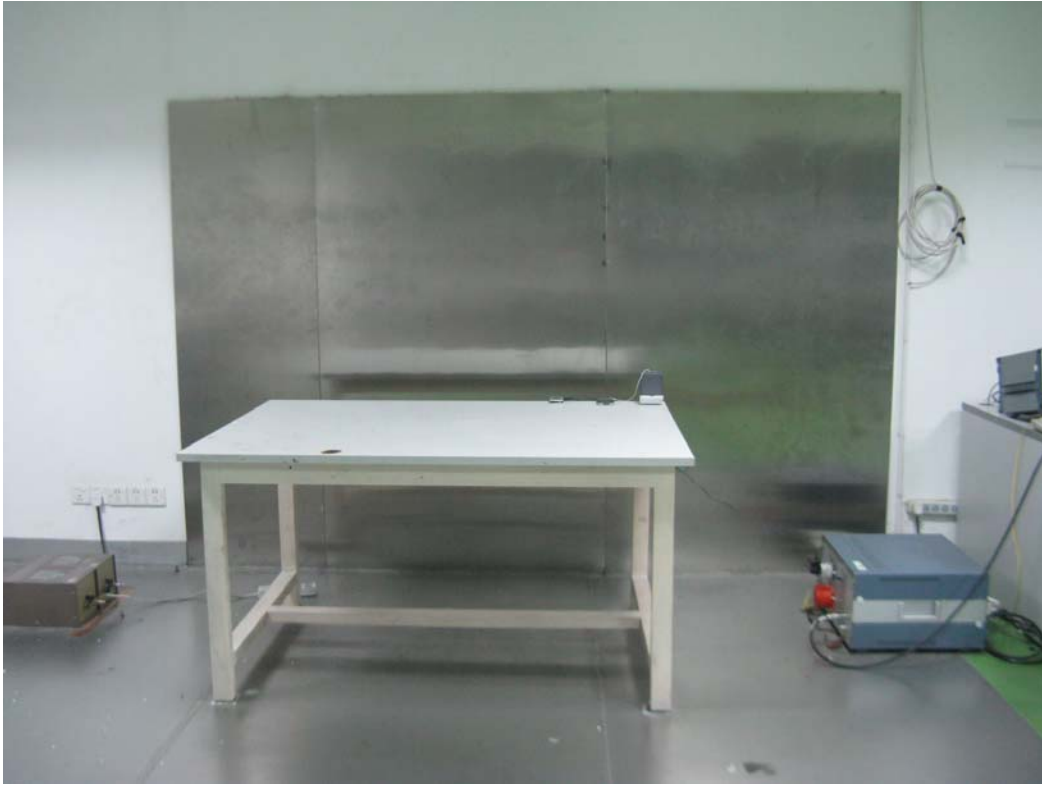
Conducted Emission - Side View