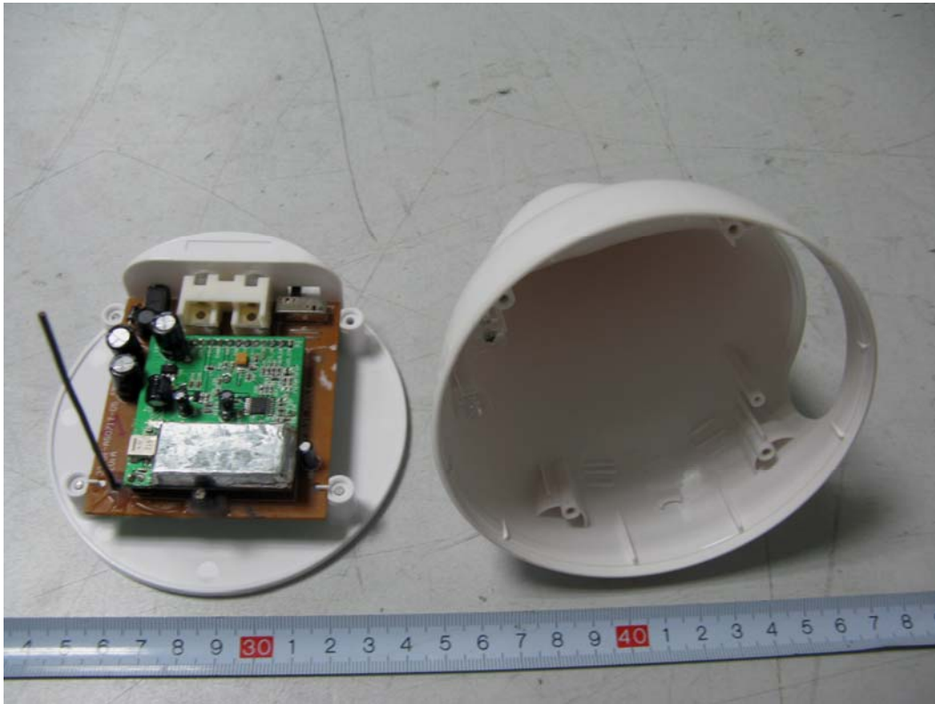
EUT- Main Board Component Top View