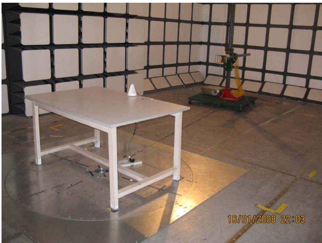
Radiated Emission - Rear View (Above 1 GHz)