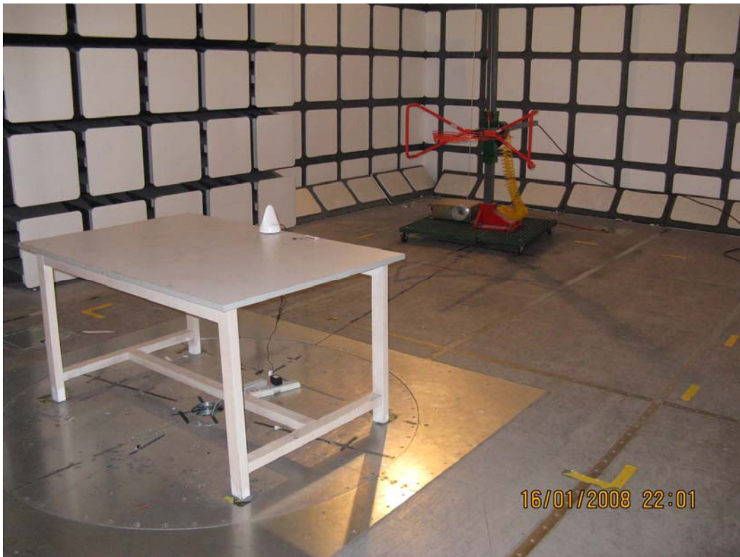
Radiated Emission - Rear View (30 -1000 MHz)