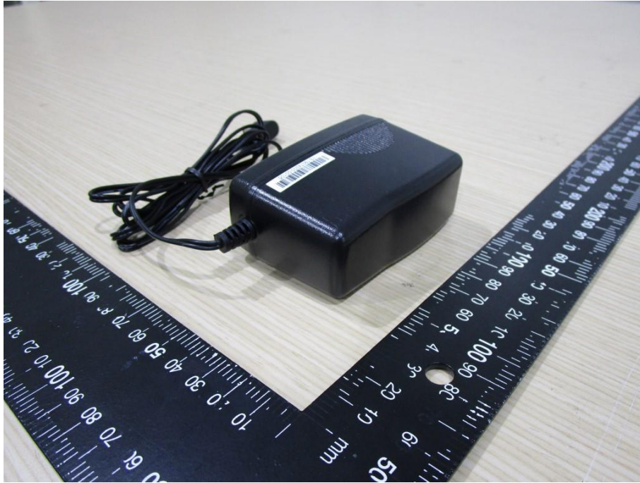
Model: 2ABL024F US