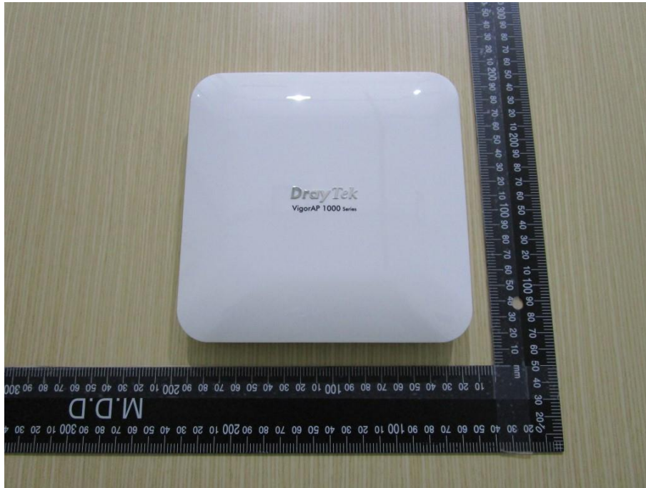
Model: Vigor AP1000C White