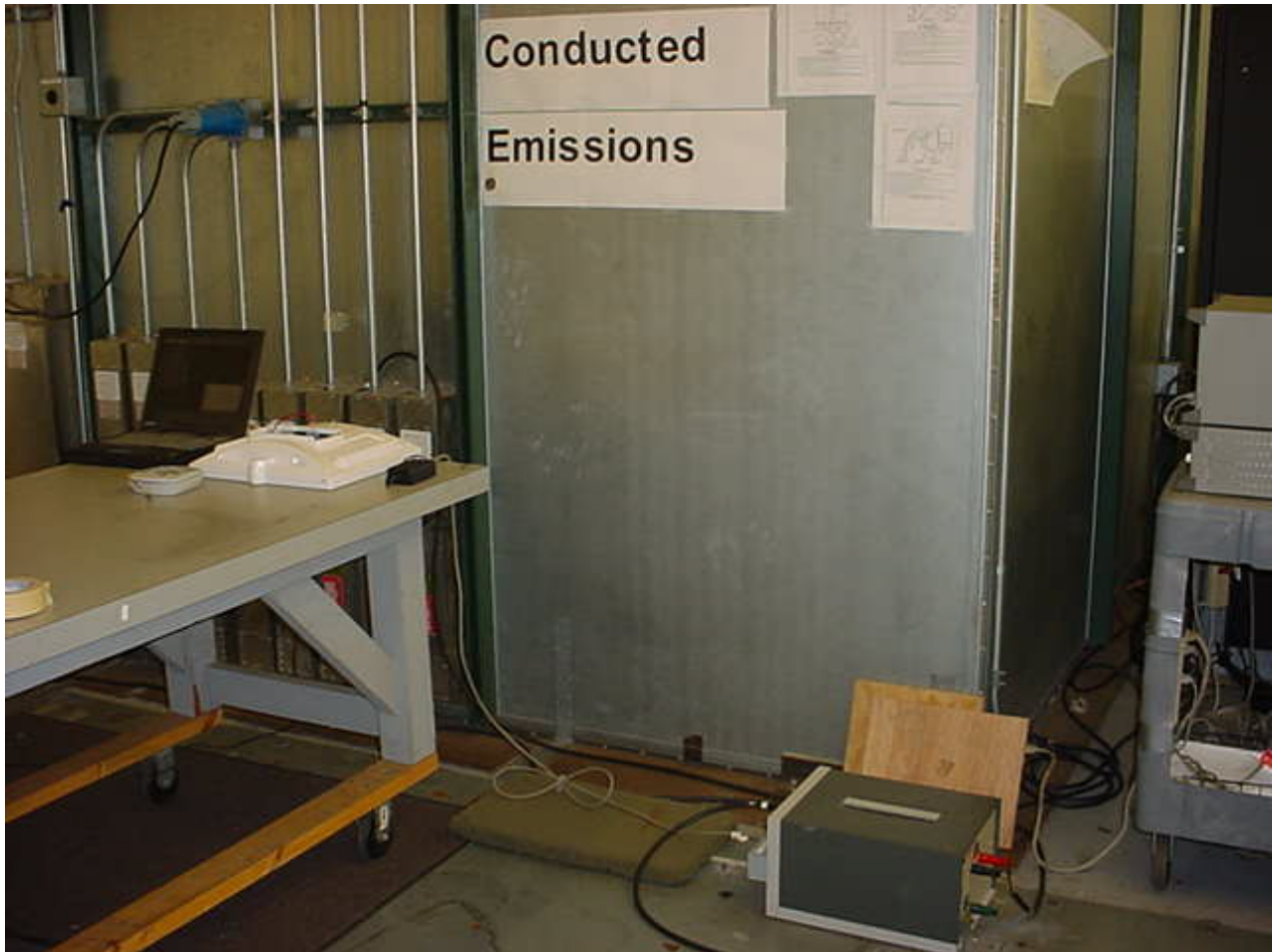
Remote, Conducted emission 1(15.107 / 15.207)