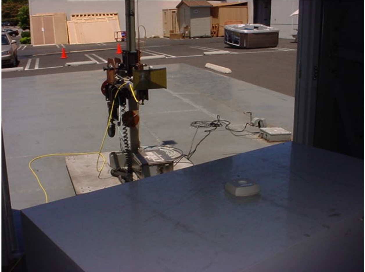
Remote Control Slave, Radiated emission (15.247/15.109)