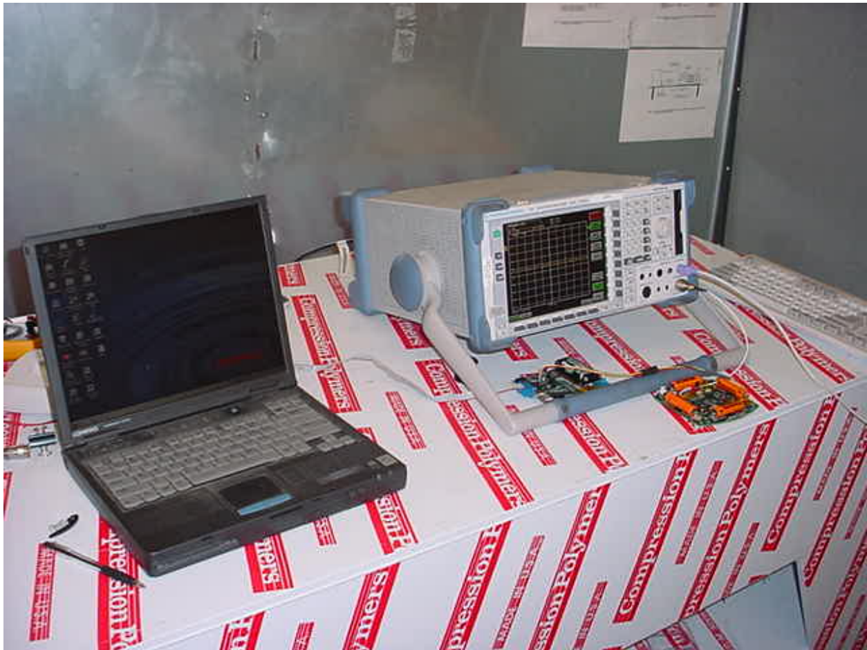
Conducted Output Power, 6 dB Bandwidth, Power density, Out of band antenna conducted emission (15.247)