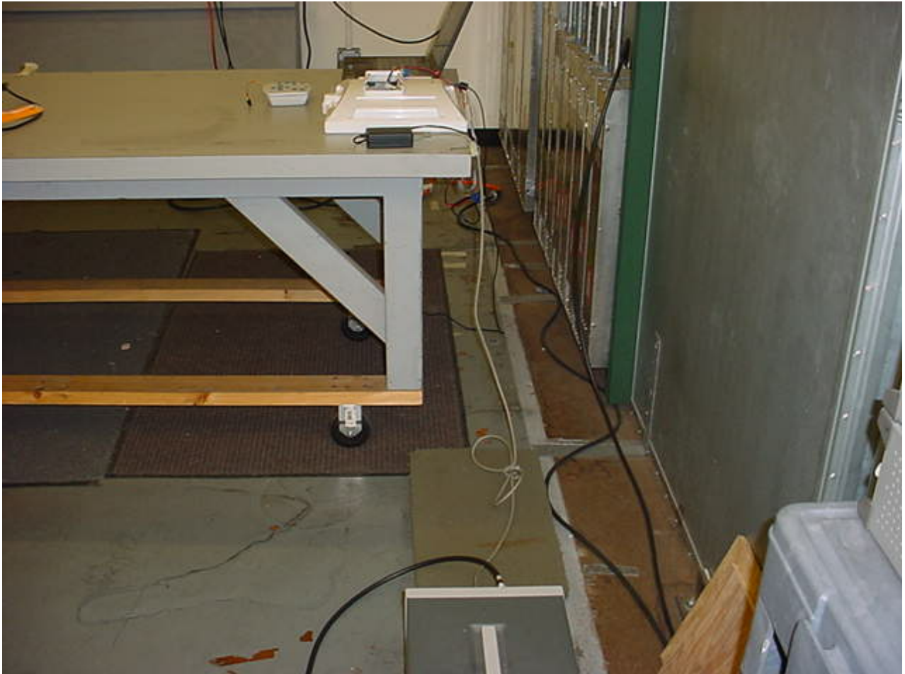
Remote, Conducted emission 2(15.107 / 15.207)