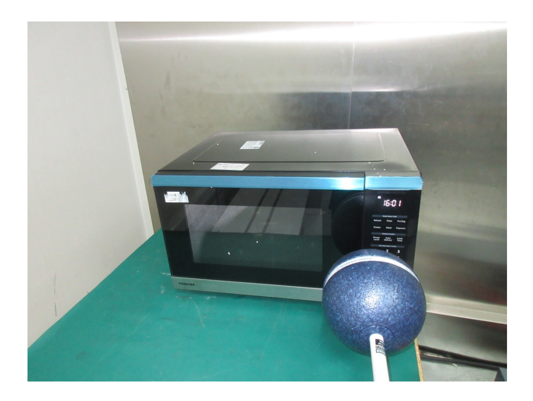
End of the report