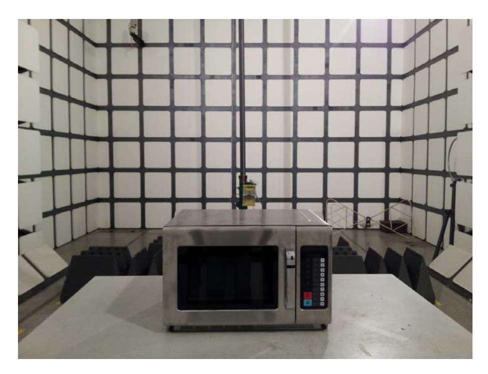
Radiated Emission Test Set-up (1-25GHz)