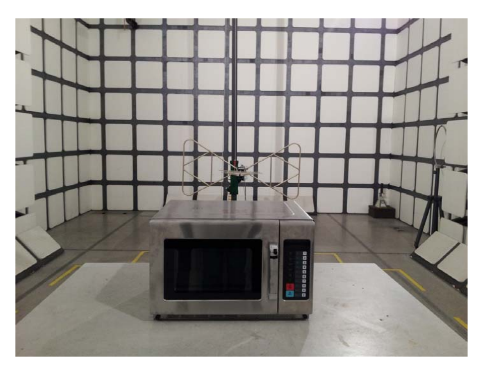
Radiated Emission Test Set-up (30 -1,000MHz)