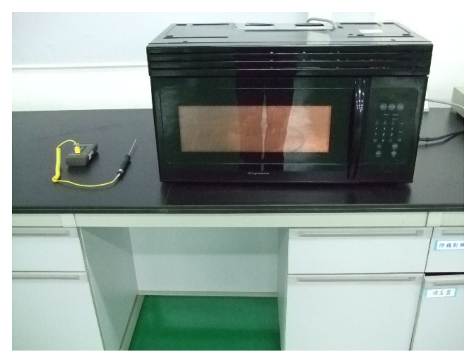
RF Output Power Test Set-up