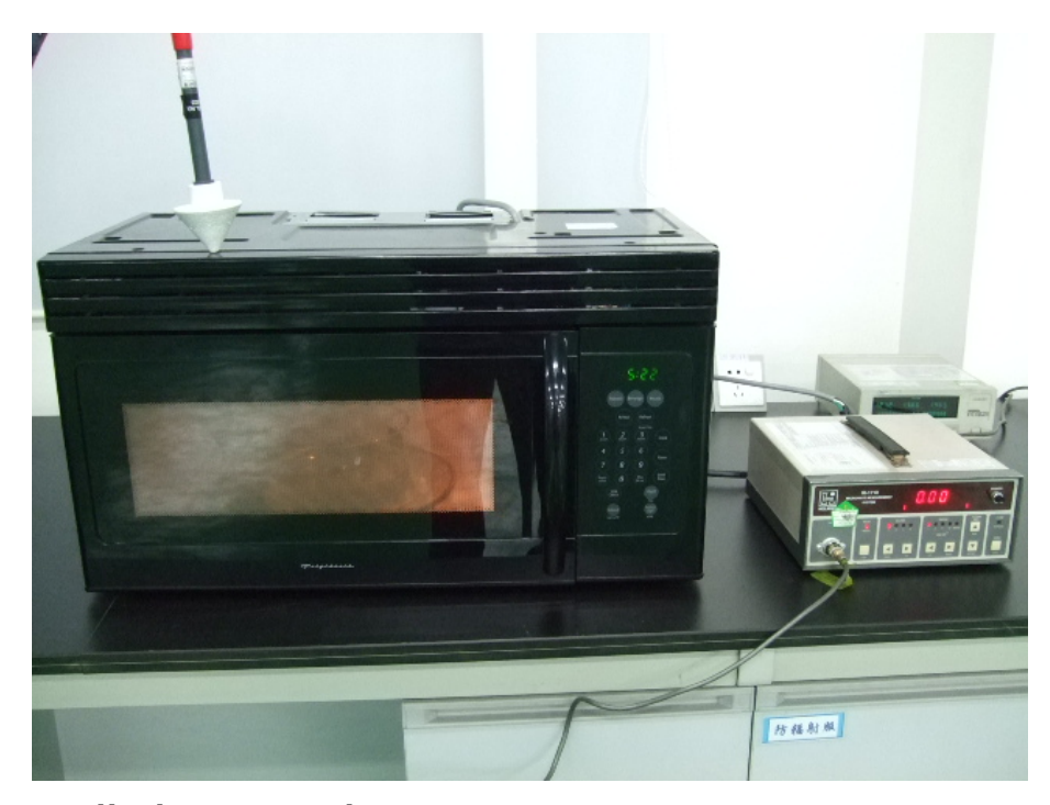
Radiation Hazard Test Set-up