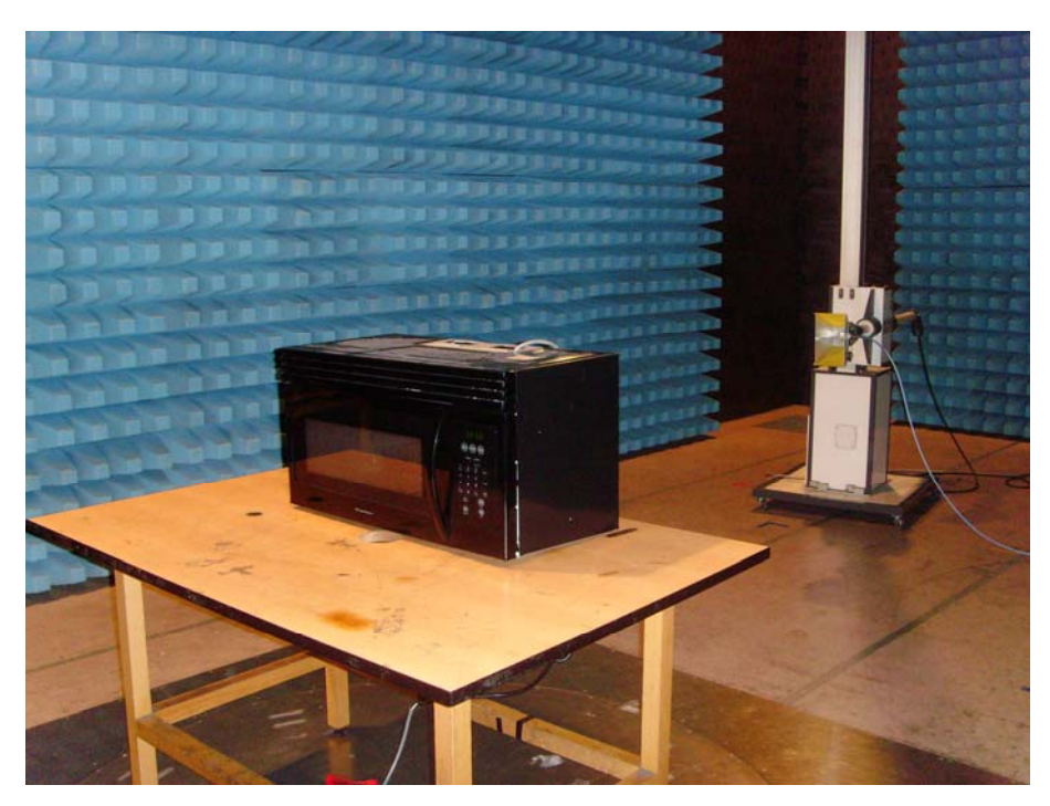
Operating Frequency Test Set-up