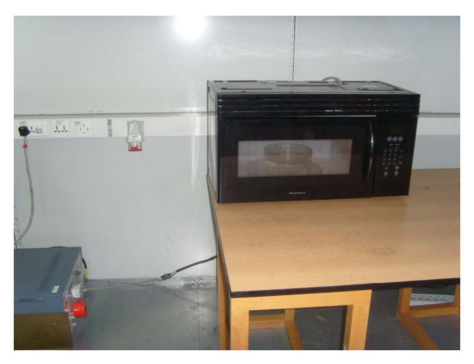
Conducted Emission Test Set-up