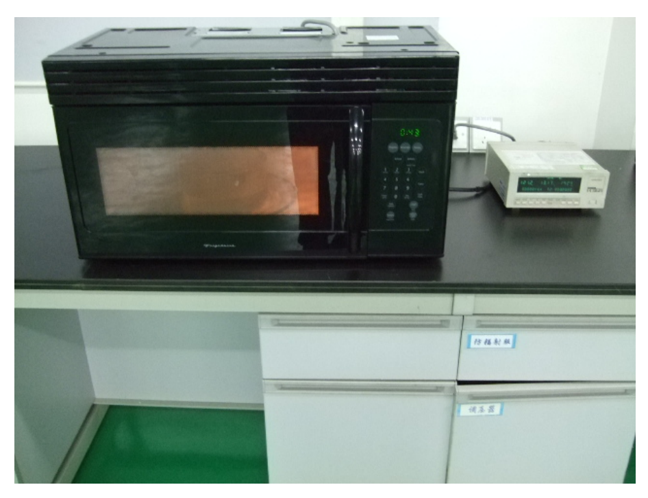
Input Power Test Set-up