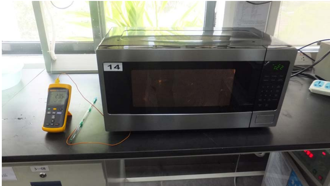
RF Output Power Test Set-Up