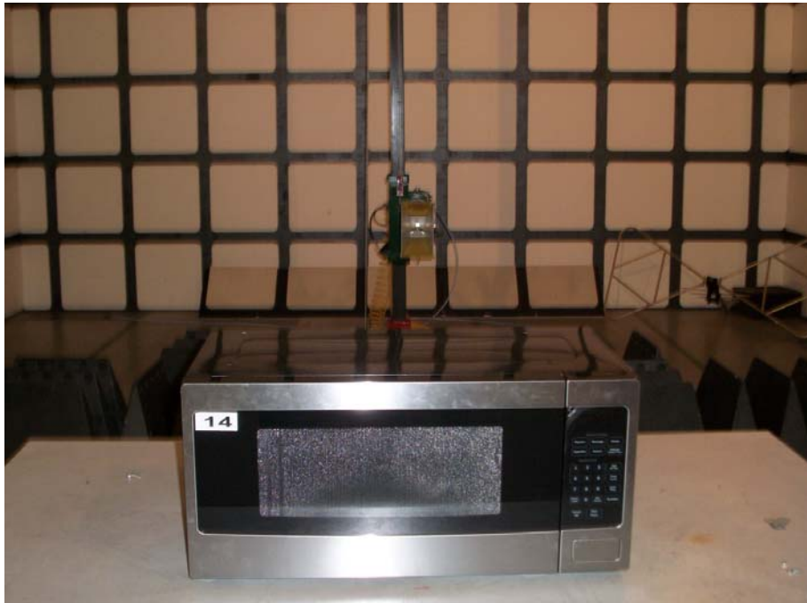
Radiated Emission Test Set-up (1-18GHz)