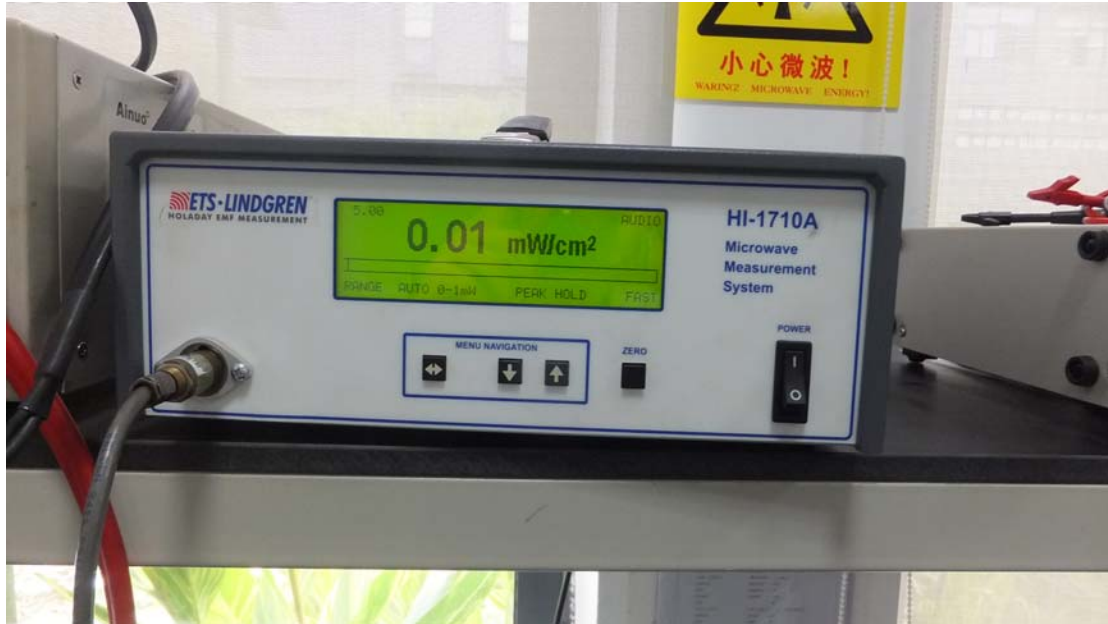
Radiation Hazard Test Set-up