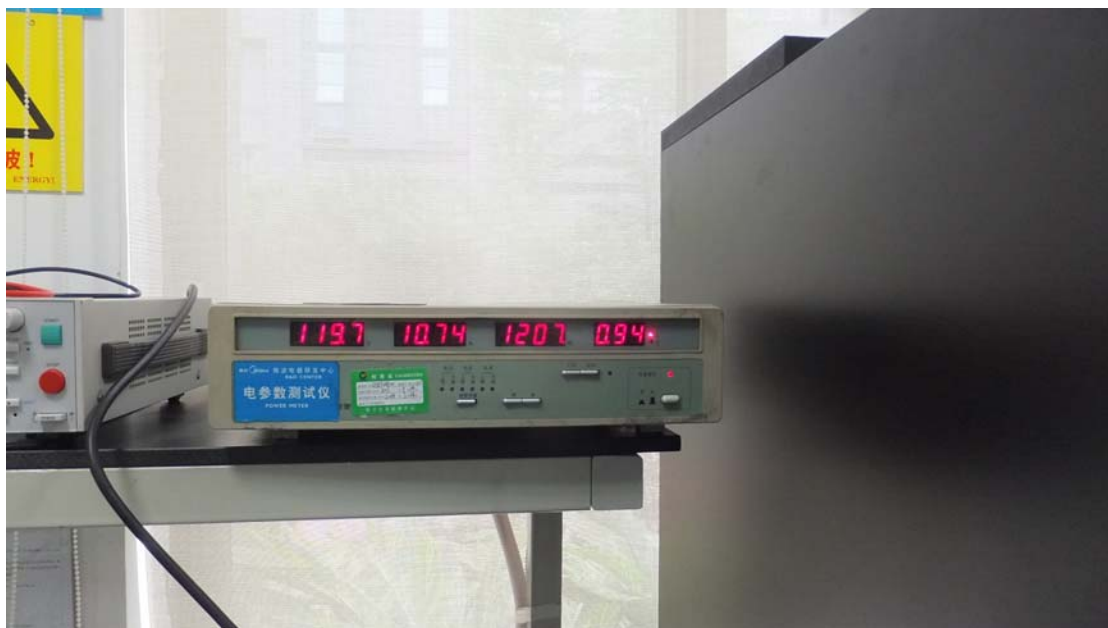
Input Power Test Set-Up