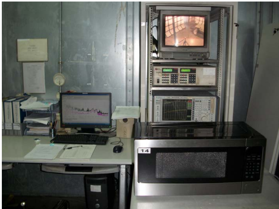
Conducted Emission Test Set-up