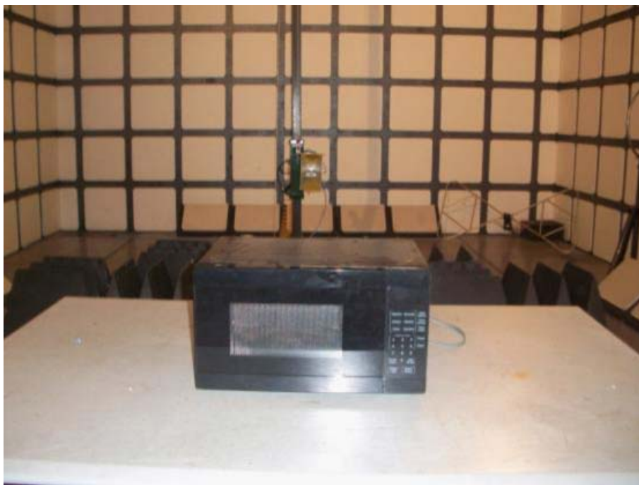
Operating Frequency Test Set-up