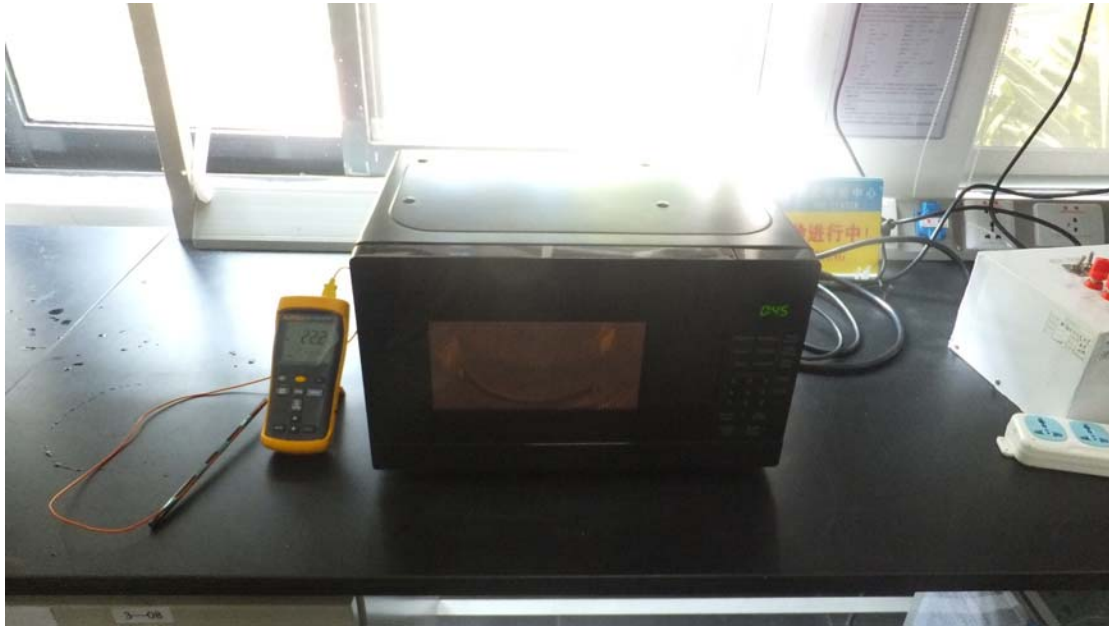
RF Output Power Test Set-Up