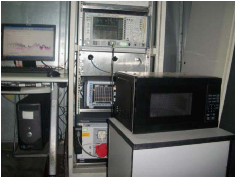
Conducted Emission Test Set-up