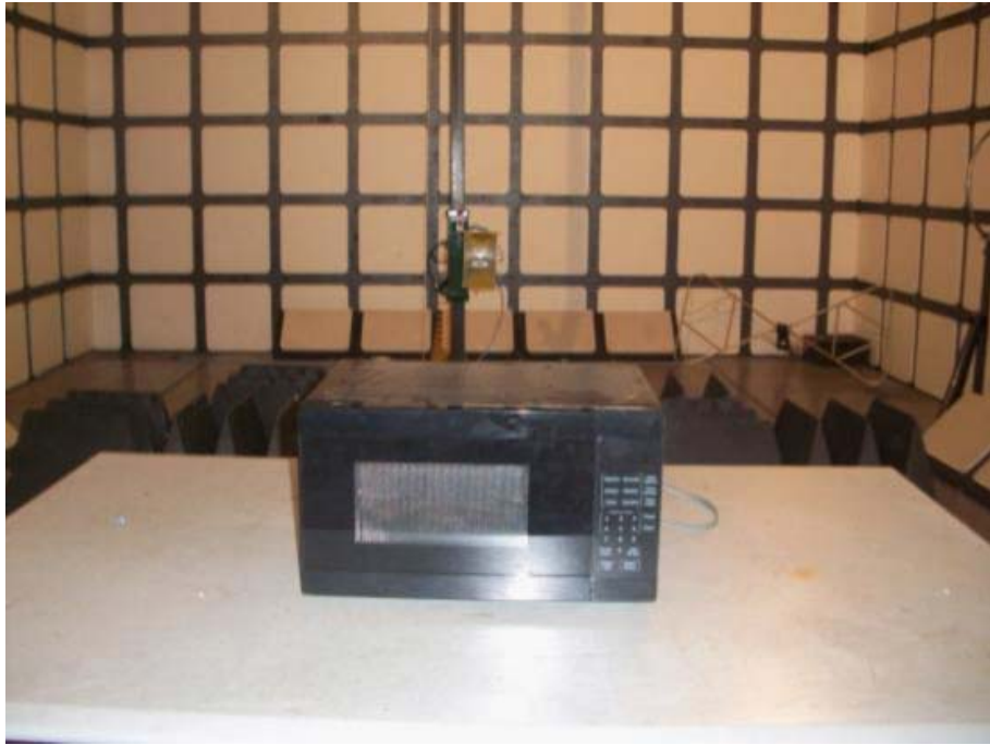
Radiated Emission Test Set-up (1-18GHz)