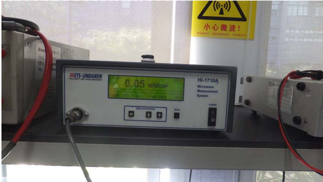
Radiation Hazard Test Set-up