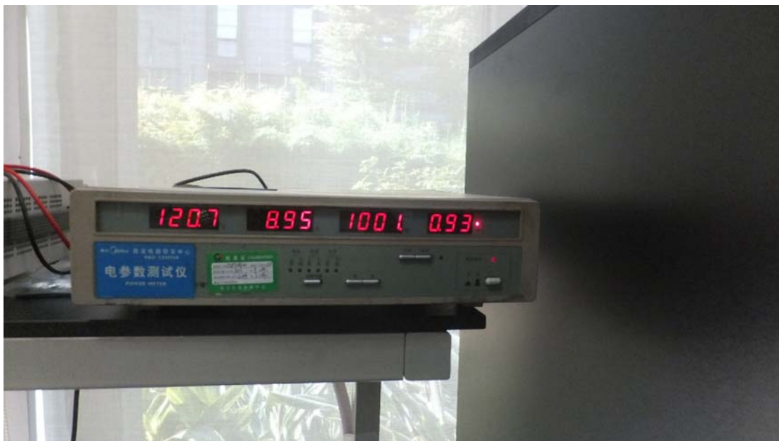
Input Power Test Set-Up