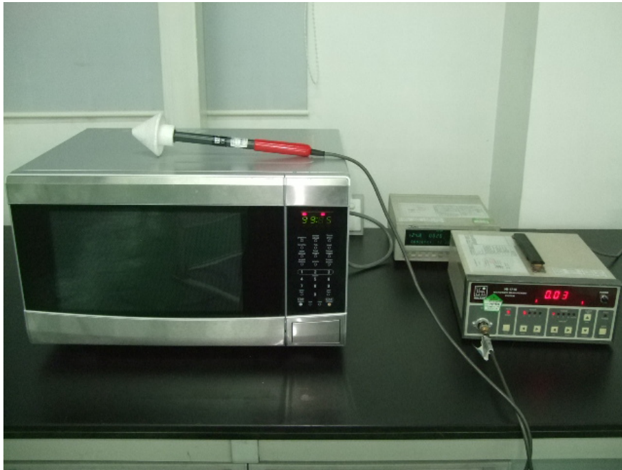
Radiation Hazard Test Set-up