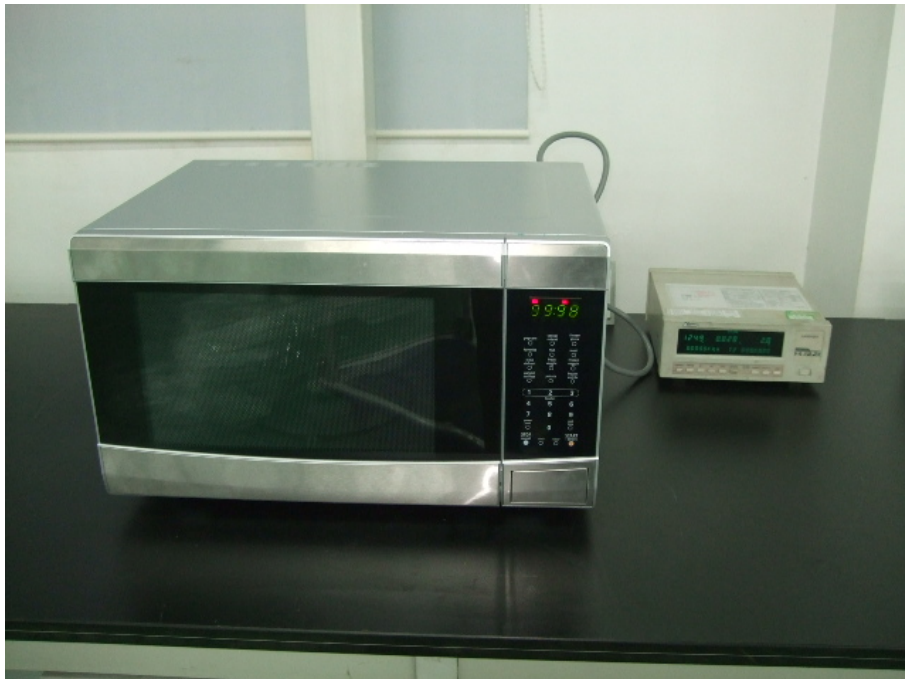
Input Power Test Set-up