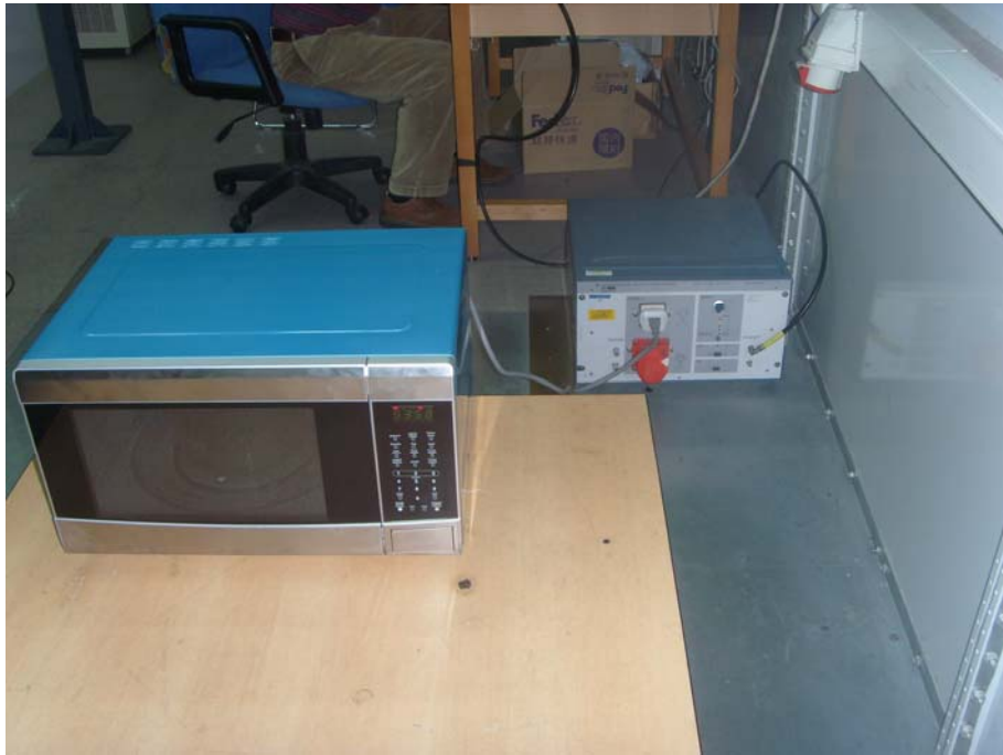
Conducted Emission Test Set-up