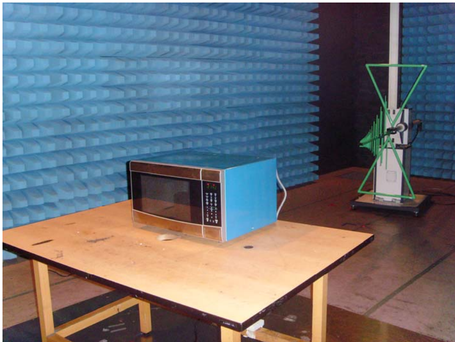
Radiated Emission Test Set-up (30~1000MHz)