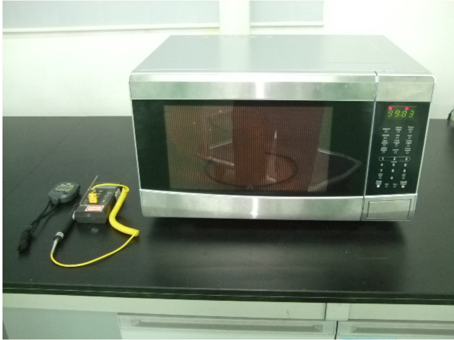
RF Output Power Test Set-up