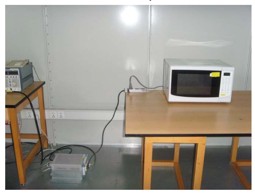
Radiated Emission Test Set-up (30~1000MHz):