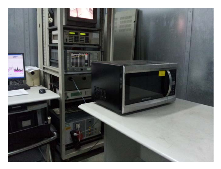
Radiated Emission Test Set-up (30 -1,000MHz):