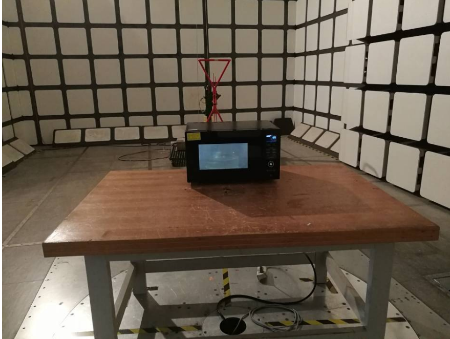
Radiated Emissions – Rear View (30 MHz – 1 GHz)