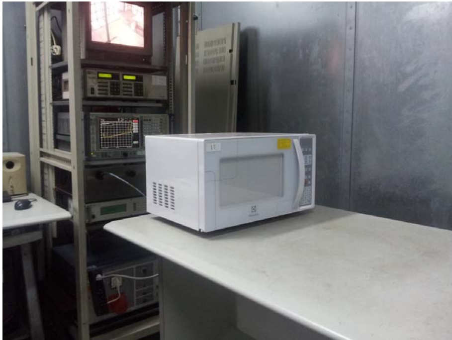
Conducted Emission Test Set-up