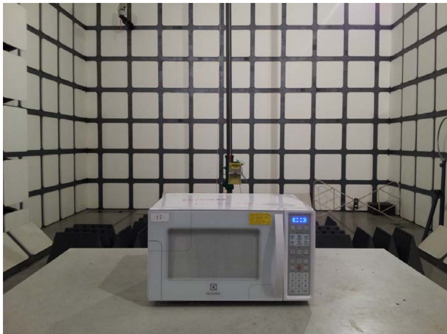
Operating Frequency Test Set-up