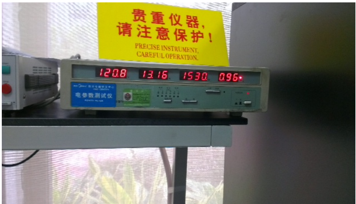
Input Power Test Set-Up