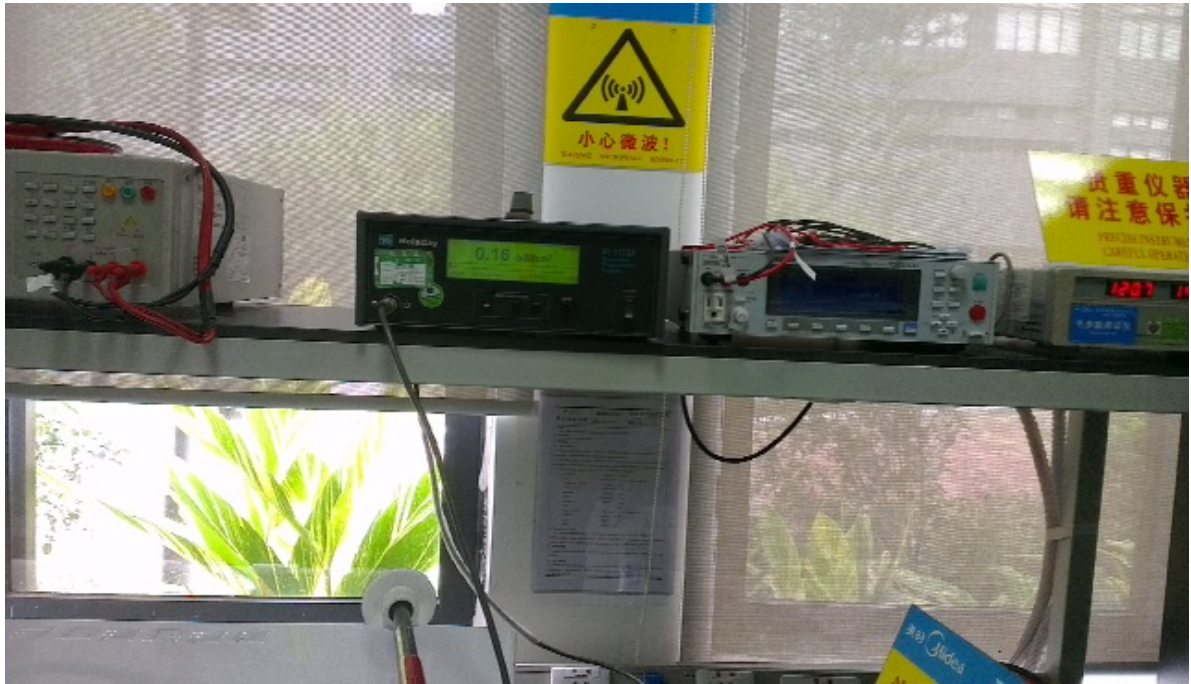
Radiation Hazard Test Set-up