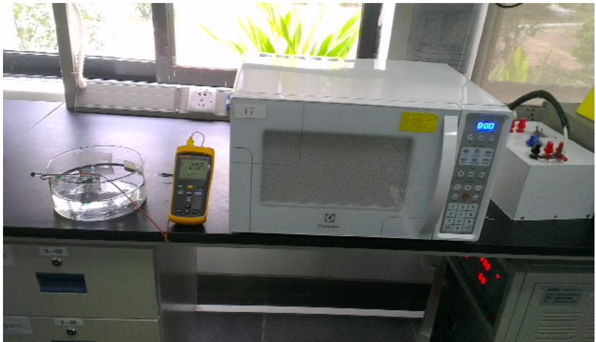
RF Output Power Test Set-Up