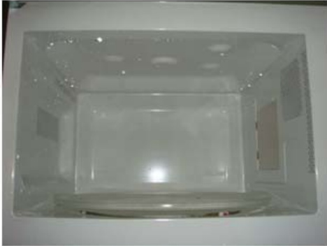
Original model: EM131MYY