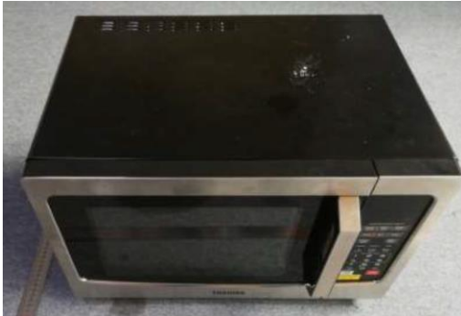
The original front/back view