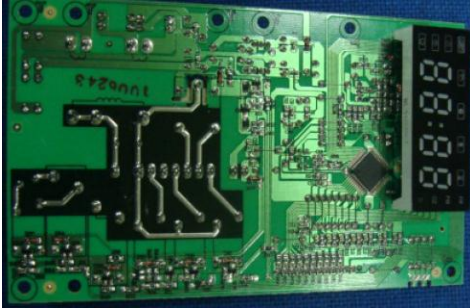
Original Mother board -bottom