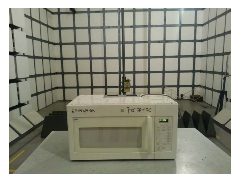
Radiated Emission Test Set-up (1-25GHz):