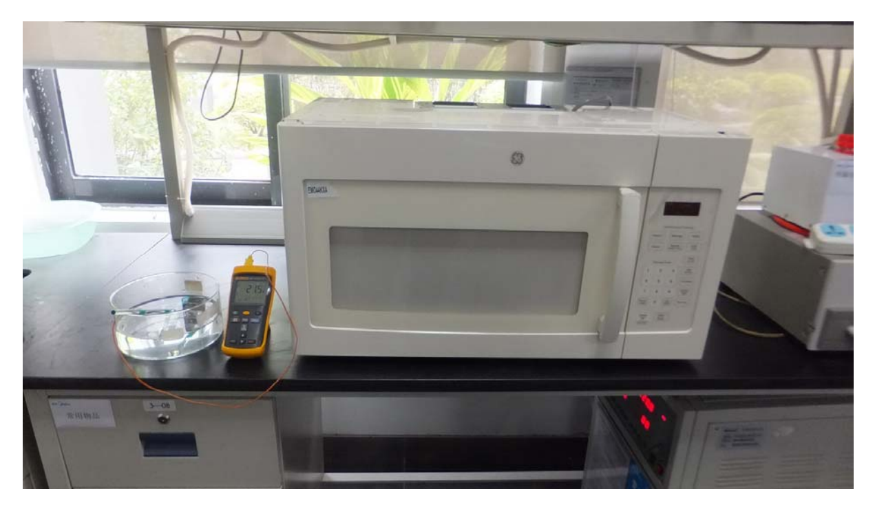
Operating Frequency Test Set-up: