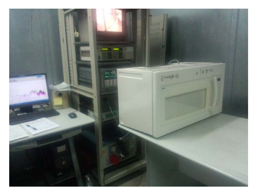
Radiated Emission Test Set-up (30 -1,000MHz):