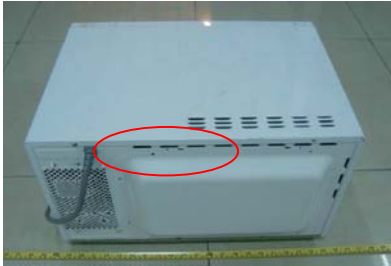
Original back view