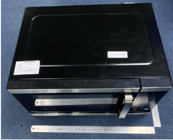
The original front/back view(EM series)