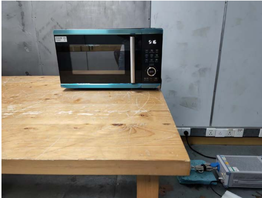
Photo of Power Line Conducted Emission Measurement