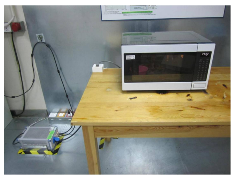
Radiated Disturbance below 1GHz