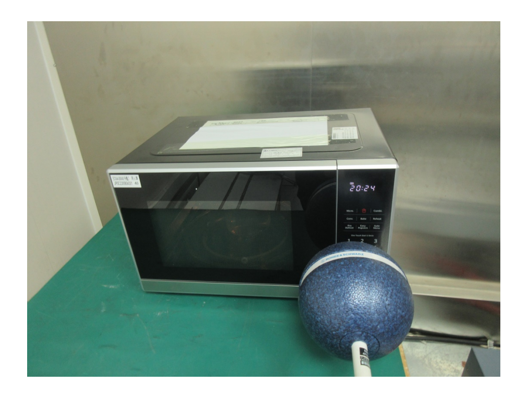
End of the report