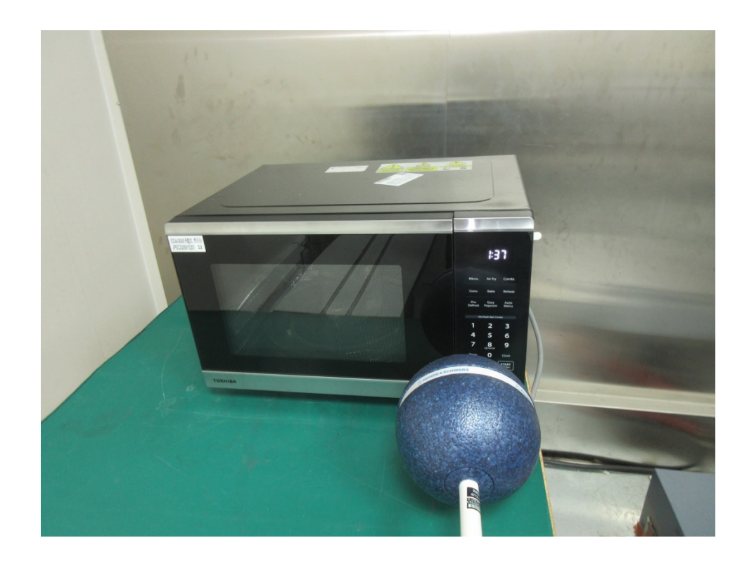
End of the report