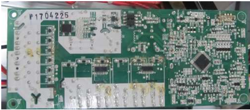
Original displaying board top&bottom view