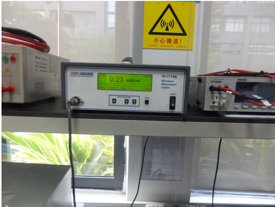
Radiation Hazard Test Set-up