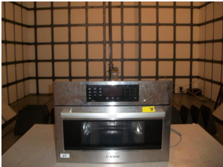
Operating Frequency Test Set-up