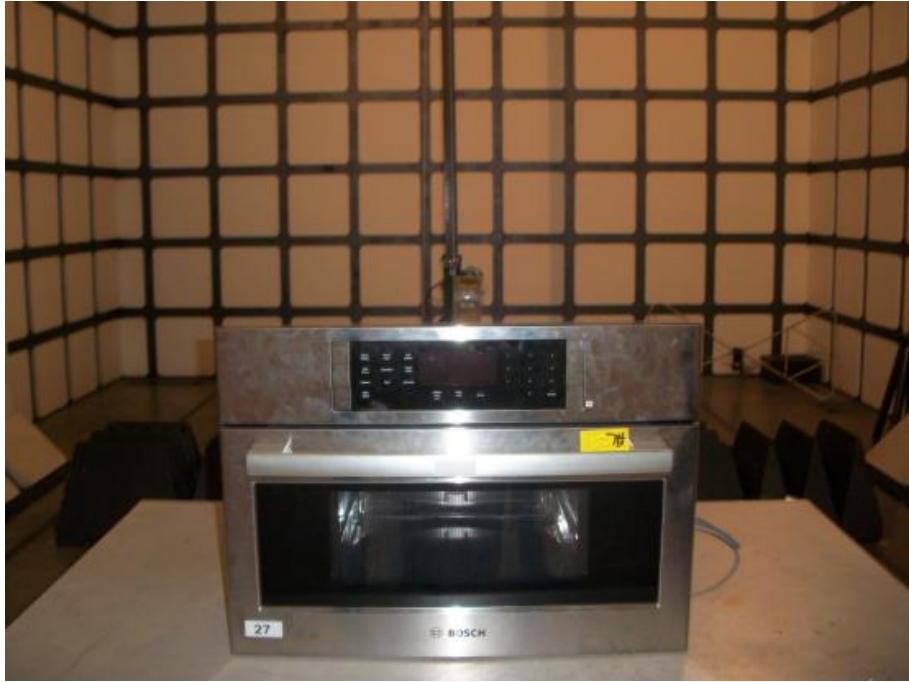
Radiated Emission Test Set-up (1-18GHz)