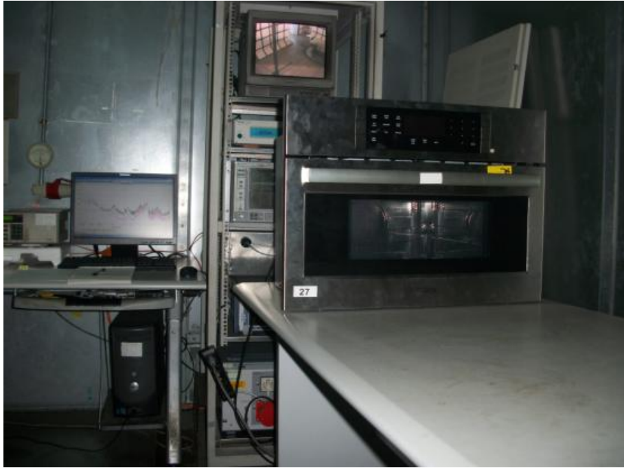
Conducted Emission Test Set-up