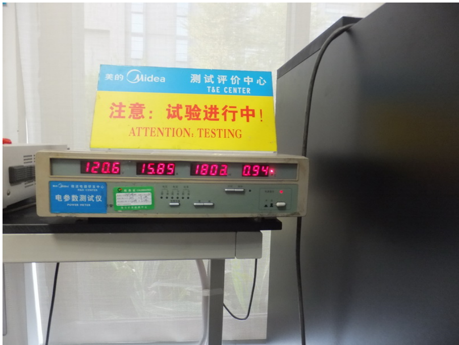
Input Power Test Set-Up