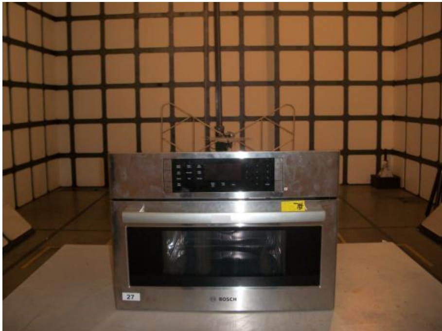
Radiated Emission Test Set-up (30 - 1,000MHz)