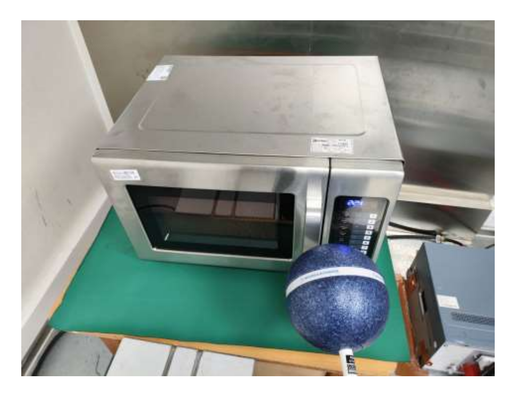
End of the report