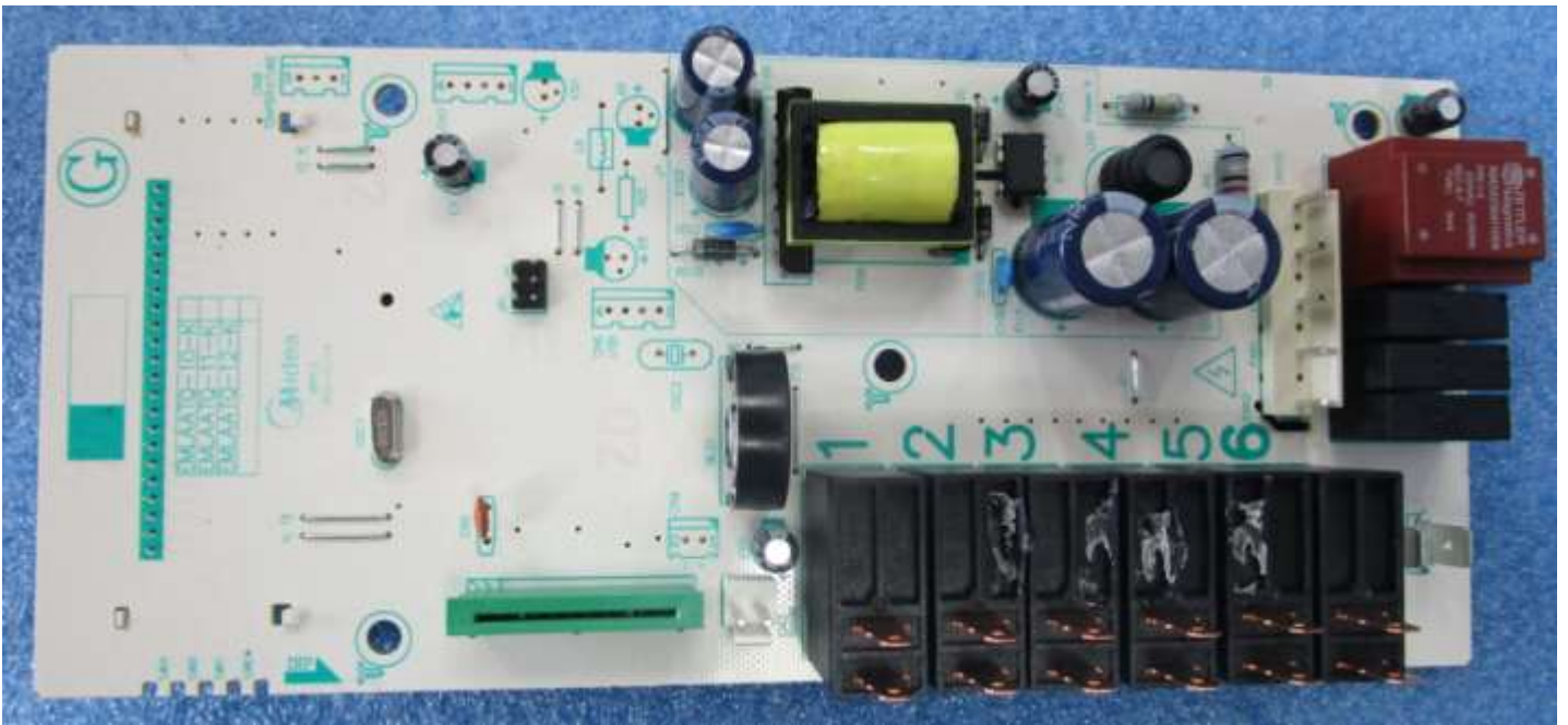
New Mother board -top view