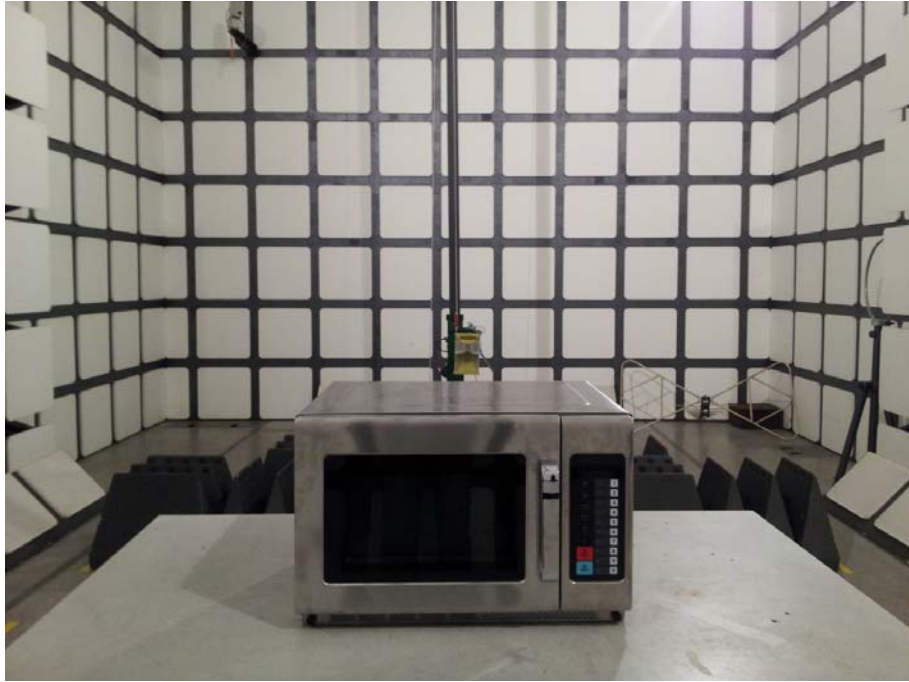
Radiated Emission Test Set-up (1-25GHz)