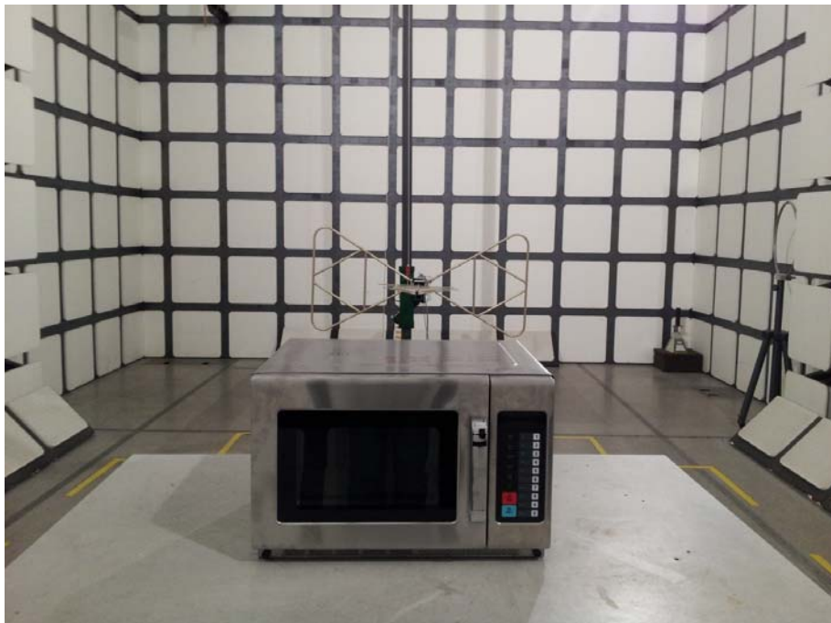
Radiated Emission Test Set-up (30 - 1,000MHz)