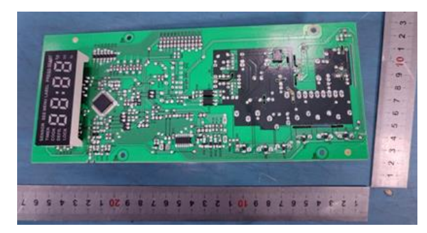
New Mother board -top view