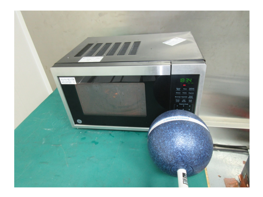
End of the report