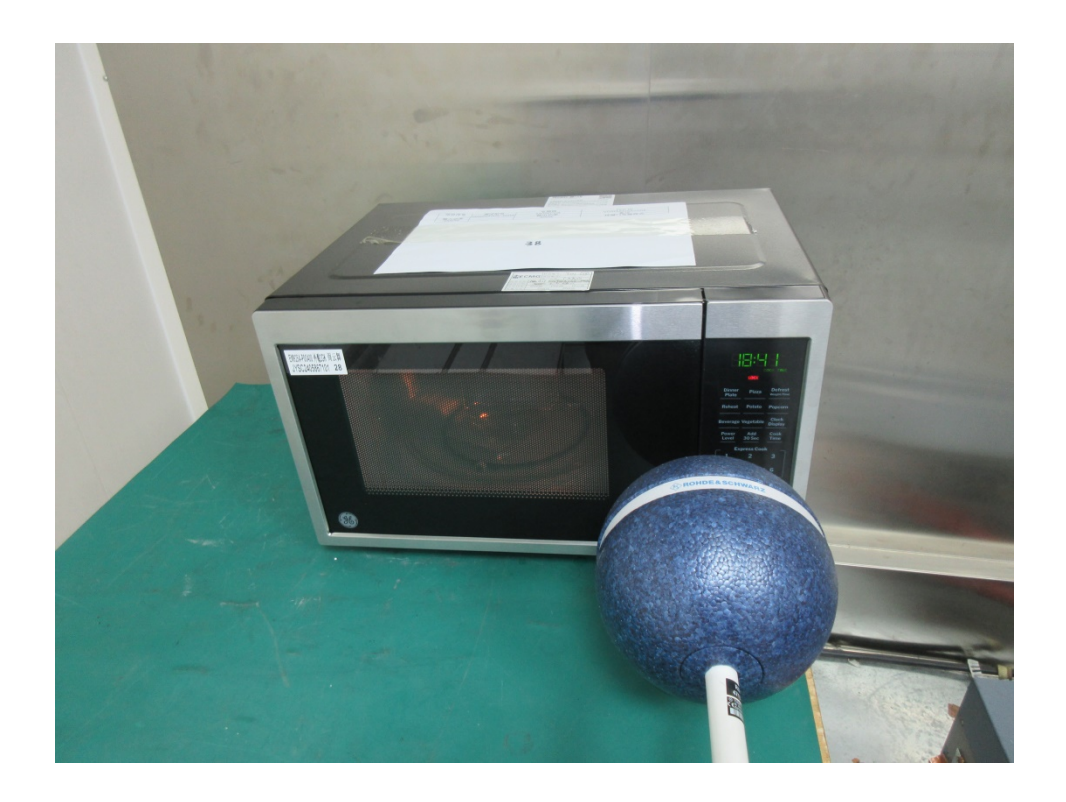
End of the report