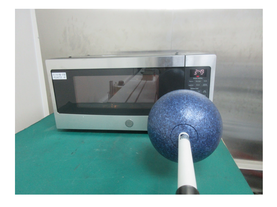
End of the report