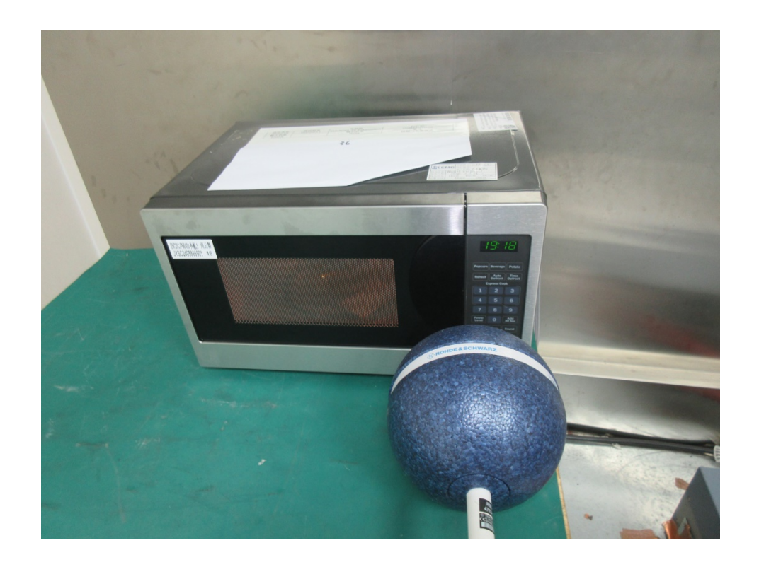
End of the report